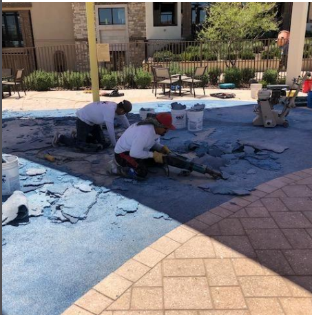
Presidio Splash Pad Resurfacing Project

The installation of the river rock along the pathways at North Lake is now complete.