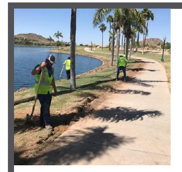
North Lake Irrigation Upgrade Project