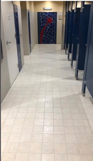
Residents Clubs Deep Cleaning Projects

River rock is being installed this week along the new sidewalks at North Lake and will continue into next week.