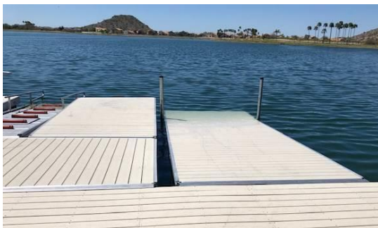
Yacht Club Large Boat Dock