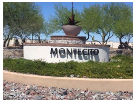
Montecito Monument Sign Refurbishment