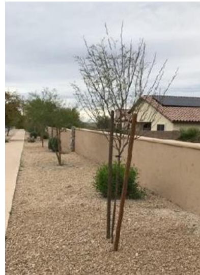
Elliot Road Tree Installation