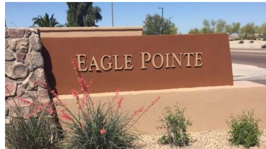
Refurbished Monument Sign