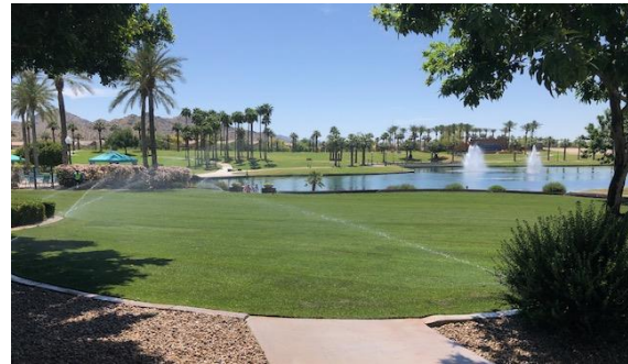
Starpointe Sod Project