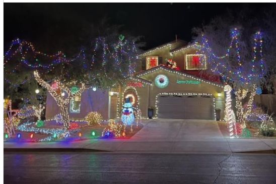
Best Traditional Holiday Décor

Many thanks to all of our residents who participated!