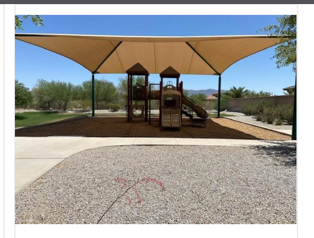
AMENITY MAINTENANCE Our team tilled the wood chips at this playground in the Ironwood Pointe neighborhood.