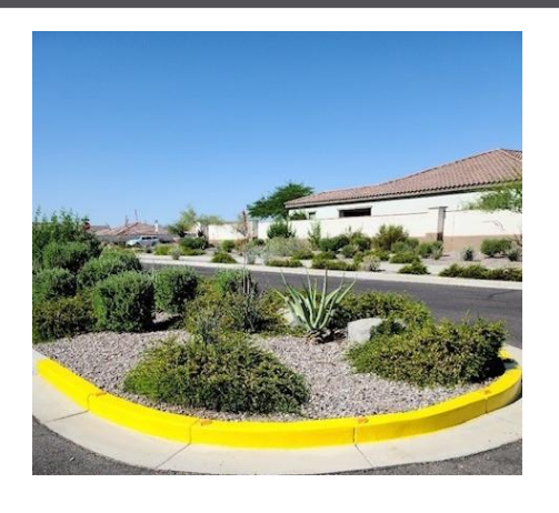
NEIGHBORHOOD MAINTENANCE The curbing at the entrance of the Tranquility neighborhood was painted by our team this week.